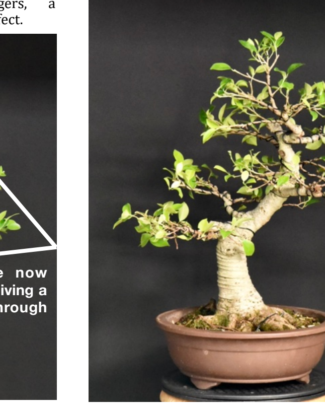
All finished, now giving the tree a much neater appearance so now I can keep it in this shape.

I made the branches a p p e a r like a n outstretched arm with the smaller branches forking out like a hand with open fingers, a pad or cloud effect.