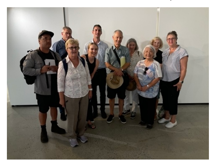
BSS, Ikebana committees and RBG staff meeting recently at the Garden Gallery to discuss the Exhibition in September.